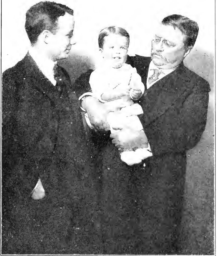
THEODORE ROOSEVELT, THEODORE ROOSEVELT, JR AND THEODORE ROOSEVELT, 3D